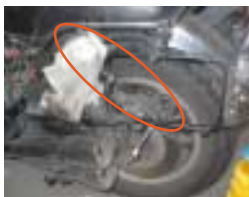
Step 3: Remove Line