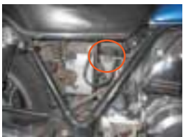
Step 1: Brake Fluid Reservoir